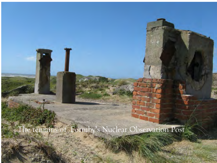
The remains of Formby's Nuclear Observation Post

A while ago, I was out walking on the dunes at Ravenmeols and somebody said 'There's the wartime observation post.' I replied that what we were looking at were the remains of a much more recent structure, built in the 1960s as a fully equipped nuclear fallout shelter, ready for World War Three. How did I know this? Well, my interest goes back to 1961 when, as a schoolboy in Watford, I attended an Open Day at a newly built Royal Observer Corps Sector Operations Centre. I was fascinated by the place and its sinister purpose and still retain an interest in bunkers and underground sites.