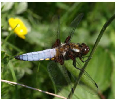
A Broad-bodied Chaser

Spells of cool weather meant dragonflies were slow to appear but, by the end of the month, I had seen seven species hereabouts, including three Broad-bodied Chasers , a spectacular insect that is moving north with climate change and which has only recently become established in our area.