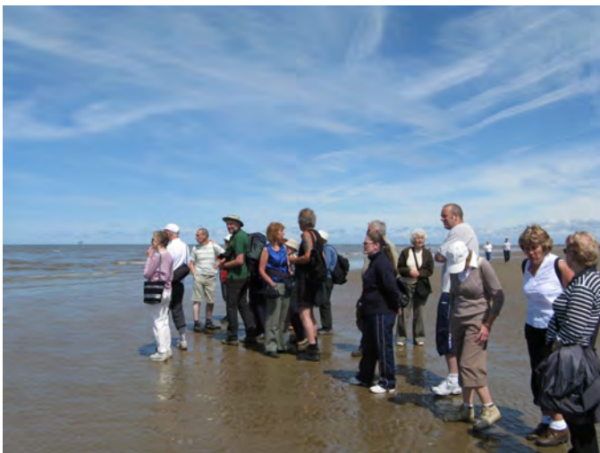
Looking for the lower boundary marker!

The History Group has enjoyed a busy but enjoyable summer. The highlight of this was the publication of 'Sand and Sea', published by Sefton Library Services and launched at the Luncheon Club, Rosemary Lane on 12 th May, (see last issue) now selling well at Pritchard's Bookshop and elsewhere.