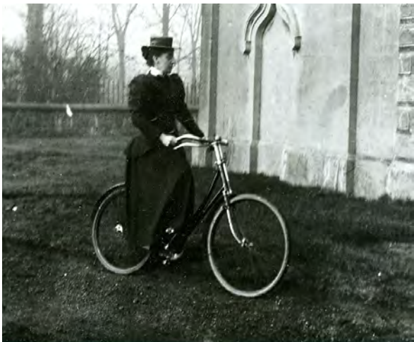
A Formby Times Reporter in 1912.