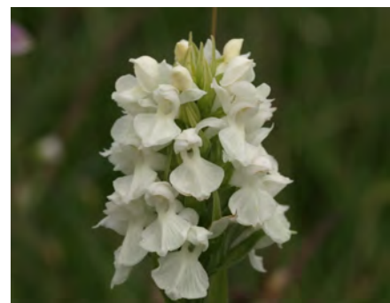
The White Pyramidal Orchid

Although large parts of the Birkdale Green Beach lagoons dried up during the month, it looks as though enough water survived to ensure reasonable breeding success for the Natterjack Toad . I counted a record number of 266 spawn strings this spring, suggesting that the total population is well over 500 adults. I need to make further inquiries but the Green Beach is now quite possibly the single most important British breeding site for this endangered amphibian.